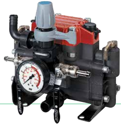
Control unit not included.