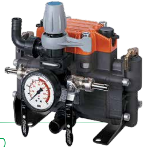
Control unit not included.