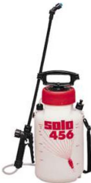
Solo: 2 Gal Chemical Resistant Plastic Sprayer 456HD Pump Up with Viton Seals Carpet Cleaner Package