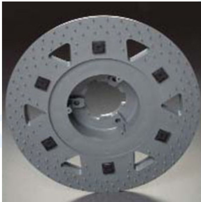
Malish: TriLok - 14 inch Pad Driver (trilock)