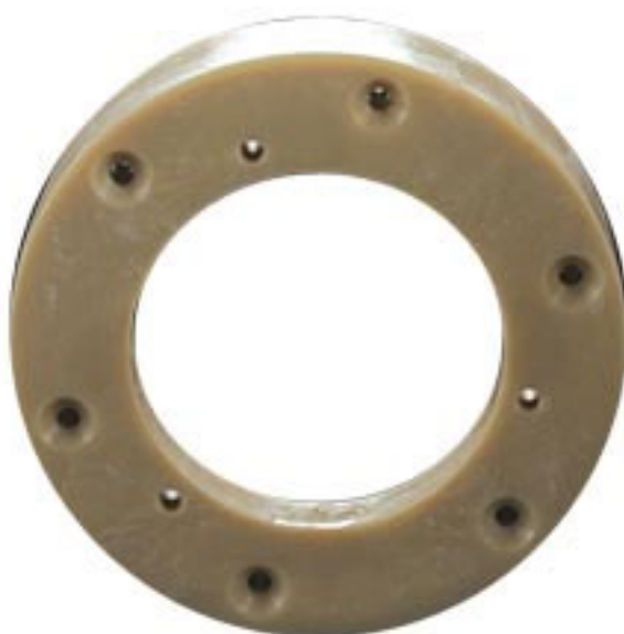
Malish: Riser Plastic 6.75" Dia 5" Ctr 1.25"