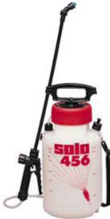
Solo: 2 Gal Chemical Resistant Plastic Sprayer 456HD Pump Up with Viton Seals Carpet Cleaner Package