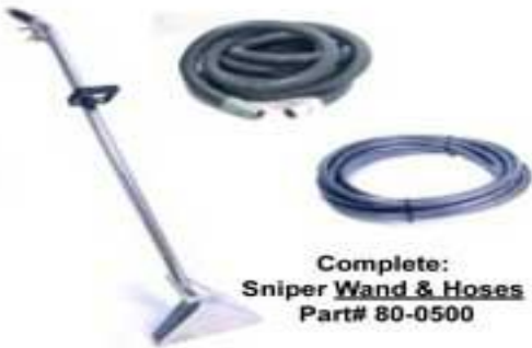
Complete: Sniper Wand & Hoses Part# 80-0500