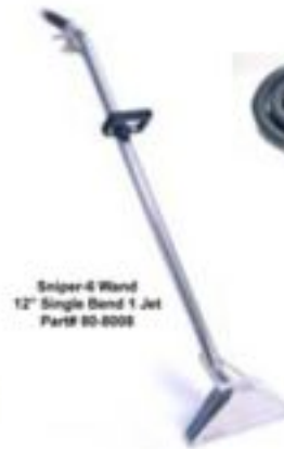
Sniper-6 Wand 12" Single Band 1 Jet Part# 80-8008