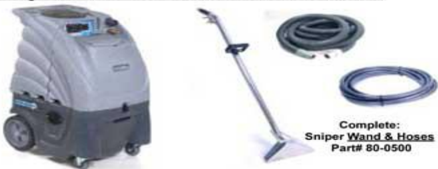
Complete: Sniper Wand & Hoses Part# 80-0500