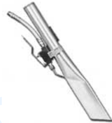
PMF: Internal spray crevice wand 500 psi

Extended Warranties for Equipment Valued up to 7499.99 Available