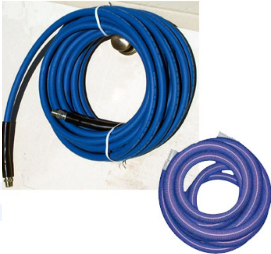
.Shazaam: Hose Set - 25ft x 1.5in - Vacuum & 1/4in Solution with QD installed