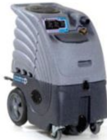
Sniper-6 Wand 12" Single Band 1 Jet Part# 80-8008