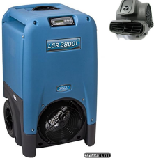
FREE Air Mover With Purchase

Model Number: F410 F Drieaz F410 F with bonus Air Mover LGR 2800i Industrial Restoration Dehumidifier Package Freight Included